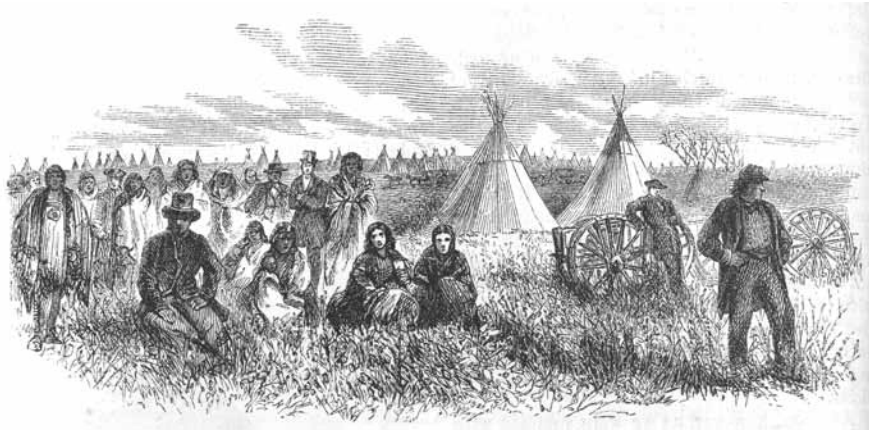
Camp Release, 1862; he, and others who opposed the fighting, offered protection to the white captives and notified Colonel Sibley when the uprising's leaders left the area. Wood engraving based on Adrian J. Ebell photograph on page 4.

The Dakota forces attacked Fort Ridgely again, but that outpost had been reinforced and held. General warfare then spread over western and southwestern Minnesota. Within a few days, twenty-three central and western Minnesota counties were depopulated and several hundred white civilians were killed. Dakota Indian losses were tiny in comparison as they totaled about thirty to forty people for the entire war. "In all, a region two hundred miles long and averaging fifty miles wide was devastated or depopulated." 2