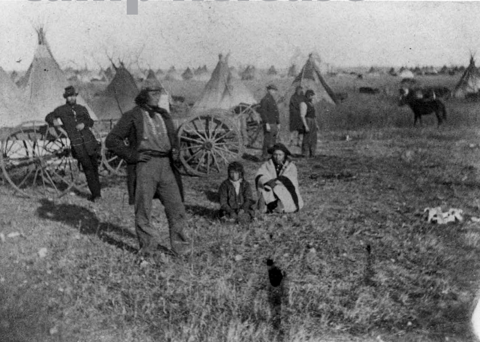
Camp Release, 1862.